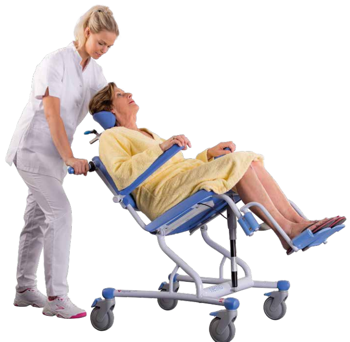
Tilting function up to 30° backwards.