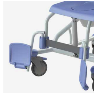
Fold-away and removable legrests.