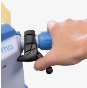
Easy to operate by means of the control handle.