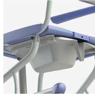
Option: Product no. 6950 1104 Commode pan.