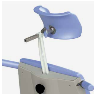
Standard equipped with a head / neck support. Adjustable in height and depth.