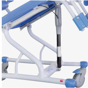
Gas spring for the infinite adjustment of the shower-toilet chair.