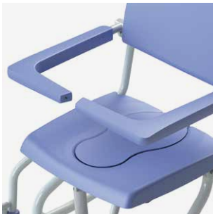
Option: Product no. 6840 5660 Foldable upholstered armrests with front lock.